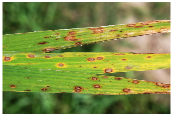
Figure 2. Typical brown leaf spot symptoms