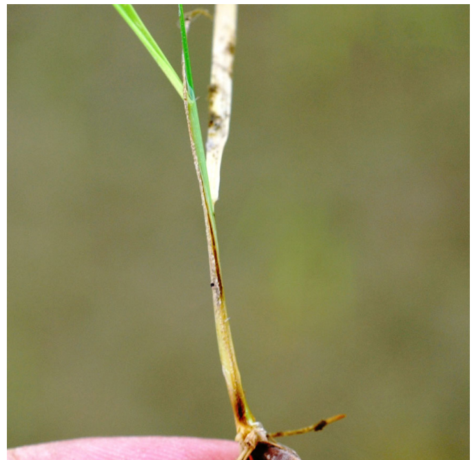
Figure 1. Seedling disease caused by the brown spot fungus

Damage from brown spot can be reduced by maintaining good rice growing conditions through proper fertilization, crop rotation, land leveling, proper soil preparation and water management. Seed-protectant fungicides reduce the severity of seedling blight caused by this seedborne fungus. In addition, some rice varieties are less susceptible than others. (See LSU AgCenter publication 2270, "Rice Varieties and Management Tips.")